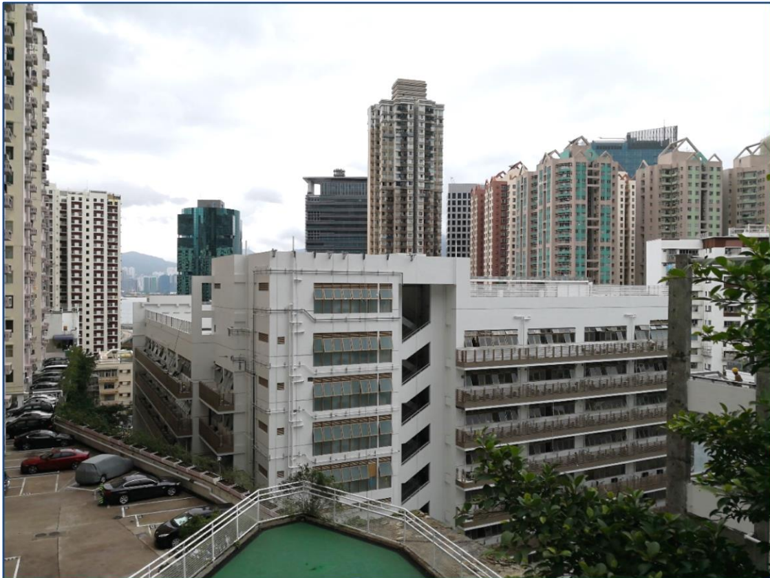
Installation of air-conditioners in progress. Installation of false ceiling support grids in progress.