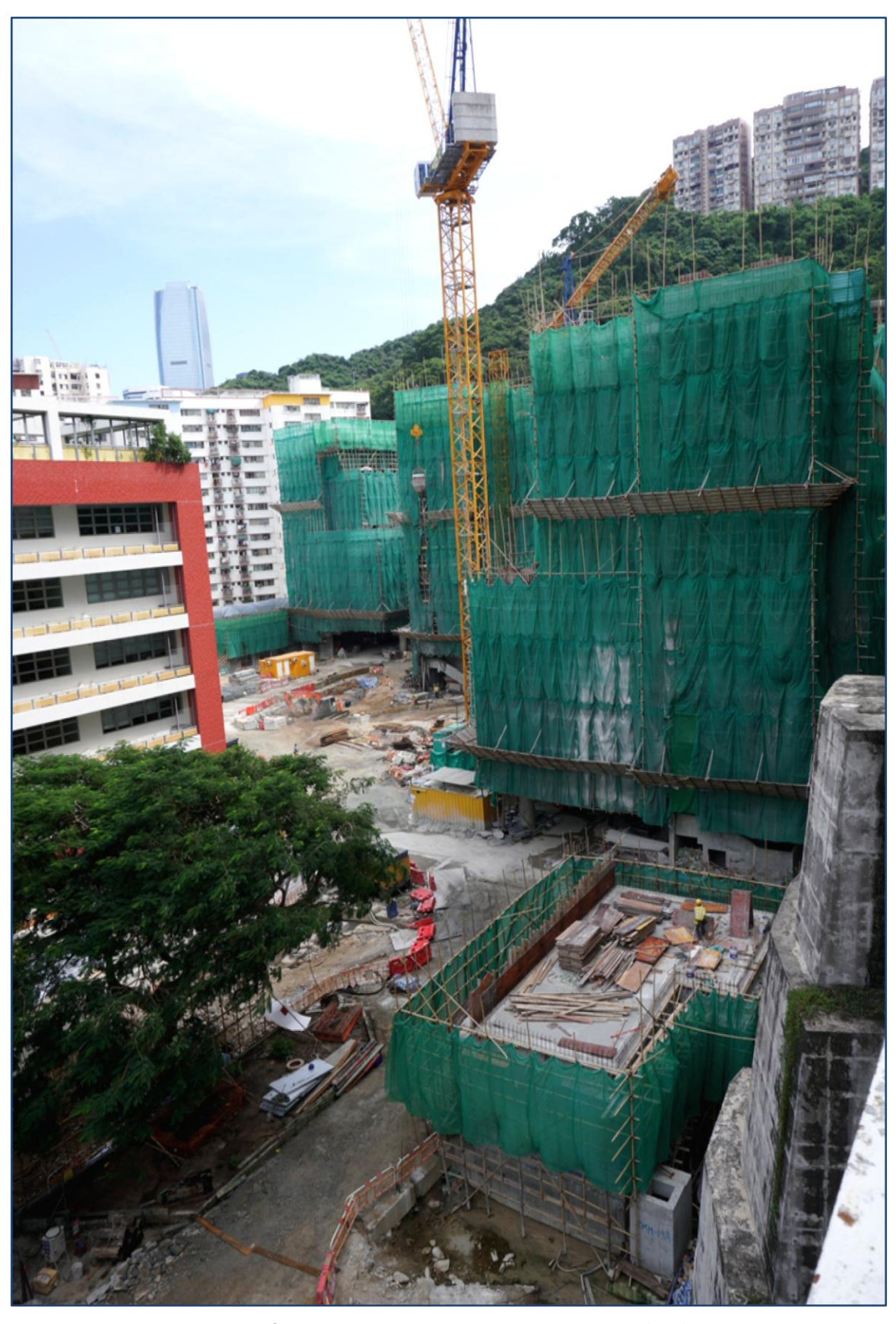
\textbf{HV Room, Transformer Room and LV Room} - Construction \ in \ progress