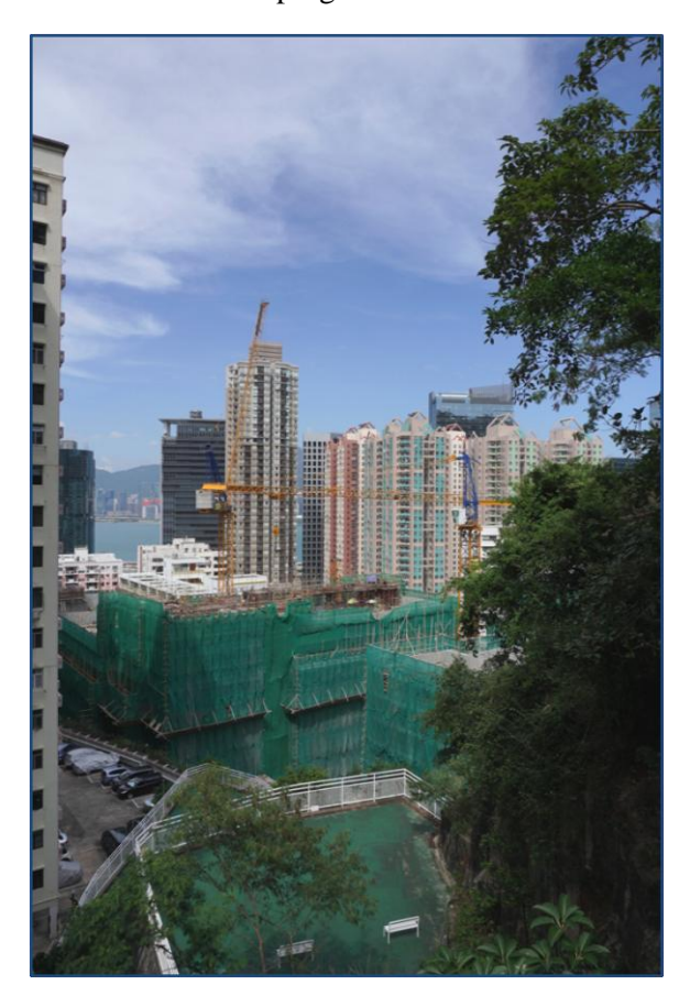
5/F of the new campus is about same level of the podium of Bedford Garden.

East Wing – Construction of peripheral parapet walls and remaining works above roof of interview room of 7/F in progress.