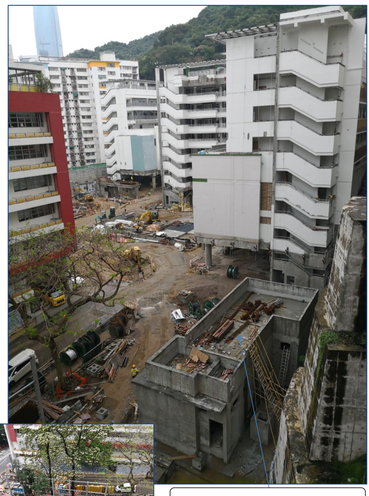
Progress Photos for New PUWYPS Campus at Pak Fuk Road as at 24 April 2018

PE Store & Boy's Toilet - Construction completed.